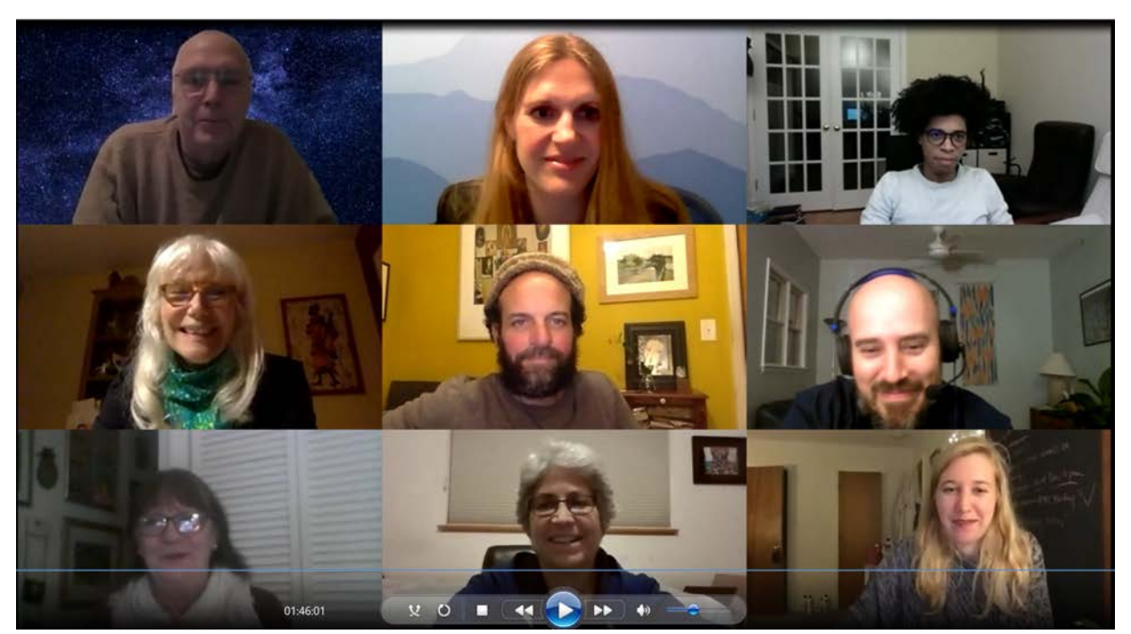
Members of Carrboro's Bee City USA Committee, the Environmental Advisory Board, at a virtual meeting. Environmental Advisory Board members met virtually starting in May 2020 due to the COVID-19 pandemic.