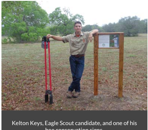
bee conservation signs.