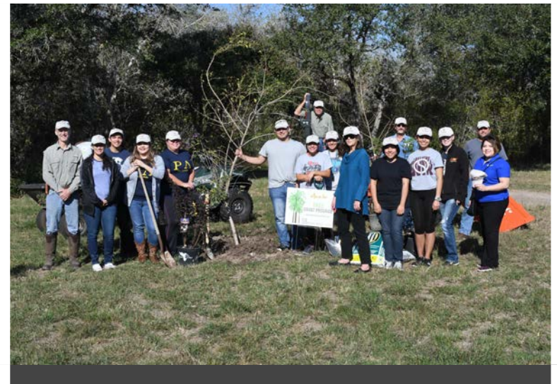
Coastal Bend College PTK members participate in pollinator habitat enhancement.