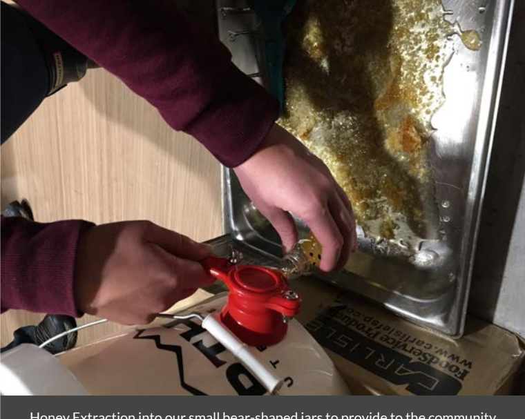
Honey Extraction into our small bear-shaped jars to provide to the community.