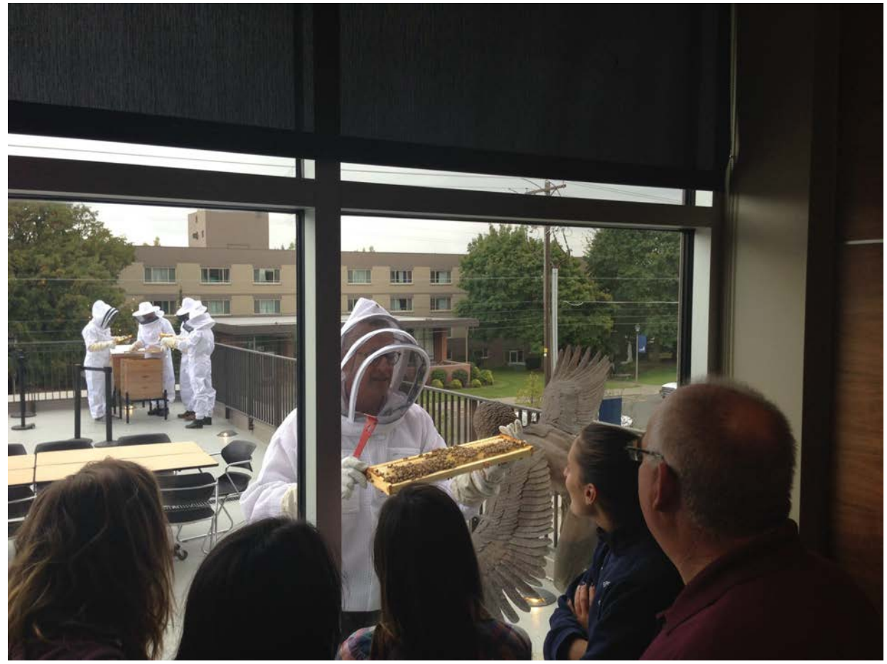
A few committee members suited up from Fall of 2019 before COVID.