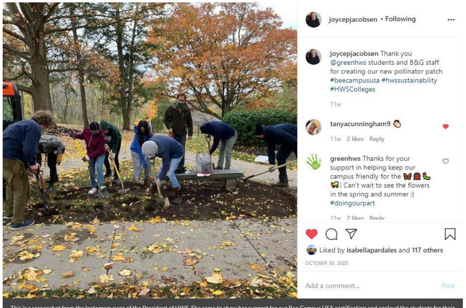
This is a screenshot from the Instagram page of the President of HWS. She came to show her support for our Bee Campus USA certification and applaud the students for their hard work in making their project a reality.