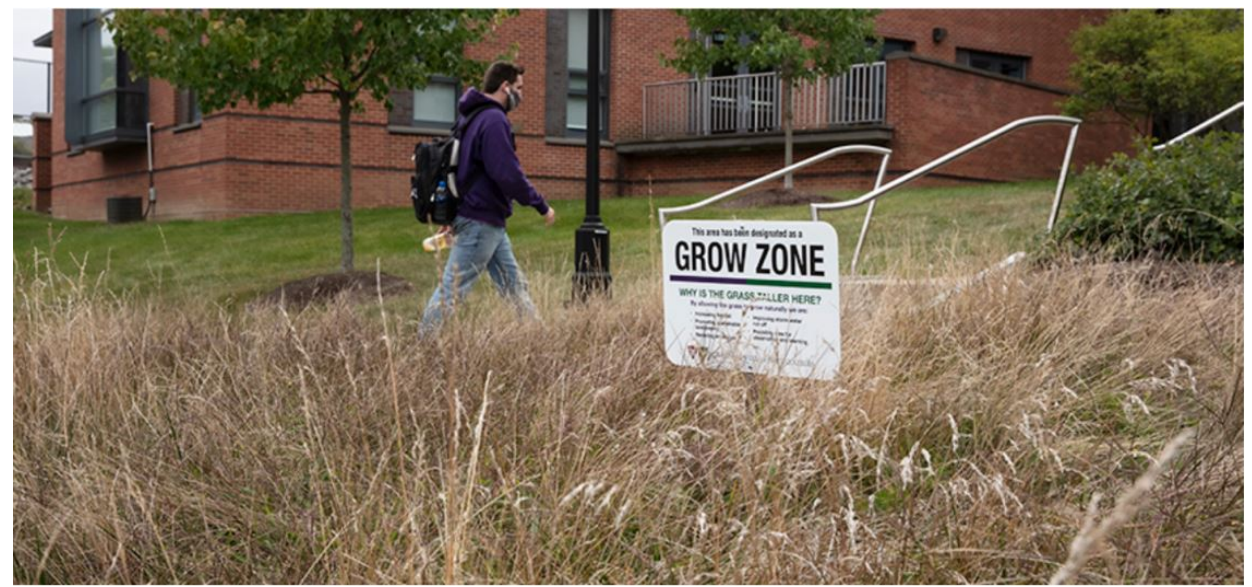
A dedicated Grow Zone located on campus.

Recommended Native Plant Supplier List: <u>HWS native plants and suppliers.pdf</u>