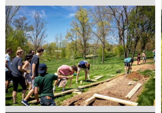
Students constructing pollinator garden beds on the East Campus Hillside.

https://www.jmu.edu/news/2019/04/24-pollinator-gardens.shtml • Bioscience Building Pollinator Gardens – Using a mini-grant from the ISNW, in spring 2019, Dr. Mike Renfroe and students in courses installed full season pollinator beds outside the Bioscience building. The beds included plants species that flower in the spring, summer and fall. The plantings focused on native plants but ensured that a mixture of perennial species was used that will be largely self-maintaining. • Orchard Mason Bee Homes – Using a mini-grant from the ISNW, Dr. Renfroe and students in courses created and installed four pollinator homes for solitary bees and ground nesting bees at the Bioscience Building Pollinator Garden to enhance the native pollinator population.