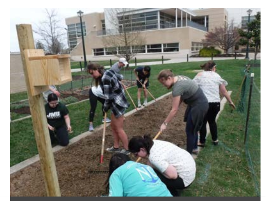
In Spring 2019, a bee home and pollinator garden were prepared by biology students near the Bioscience Building.