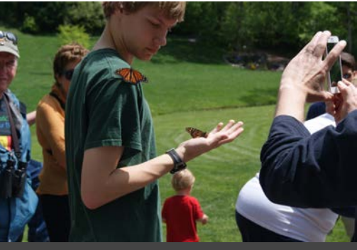
Participants release butterflies as part of an EJC Arboretum program in May 2019.