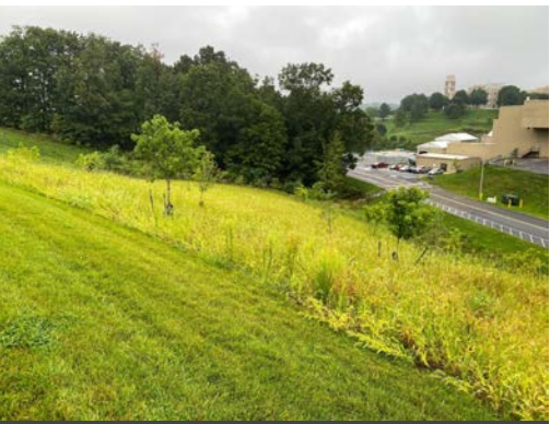
This newly established pollinator-friendly meadow is part of the JMU Land Bridge project.