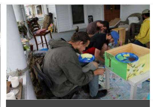
Members of the JMU Bee-Friendly club are shown participating in the Painting Hives Workshop in April 2019.