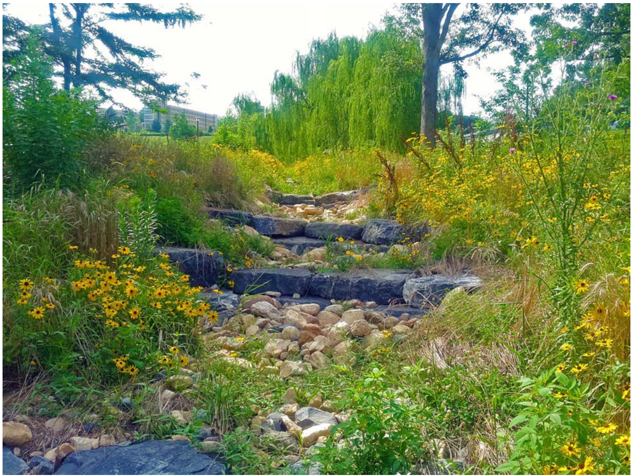
A riparian buffer along a restored stream channel where the use of pesticides are avoided.

Integrated Pest Management Plan: ipm.pdf https://www.jmu.edu/facmgt/sustainability/Bee_Campus/jmu-pollination.shtml Recommended Native Plant List: habitat.pdf https://svswcd.org/wp-content/uploads/2016/08/Native-Plants.pdf Recommended Native Plant Supplier List: habitat.pdf https://www.jmu.edu/facmgt/sustainability/Bee_Campus/jmu-pollination.shtml