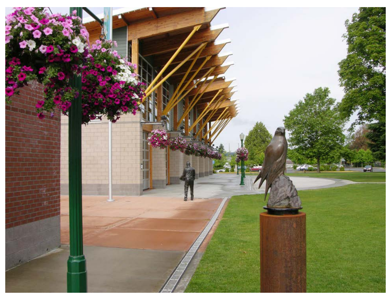
Flower hanging baskets in Downtown Puyallup - no longer treated with pesticides