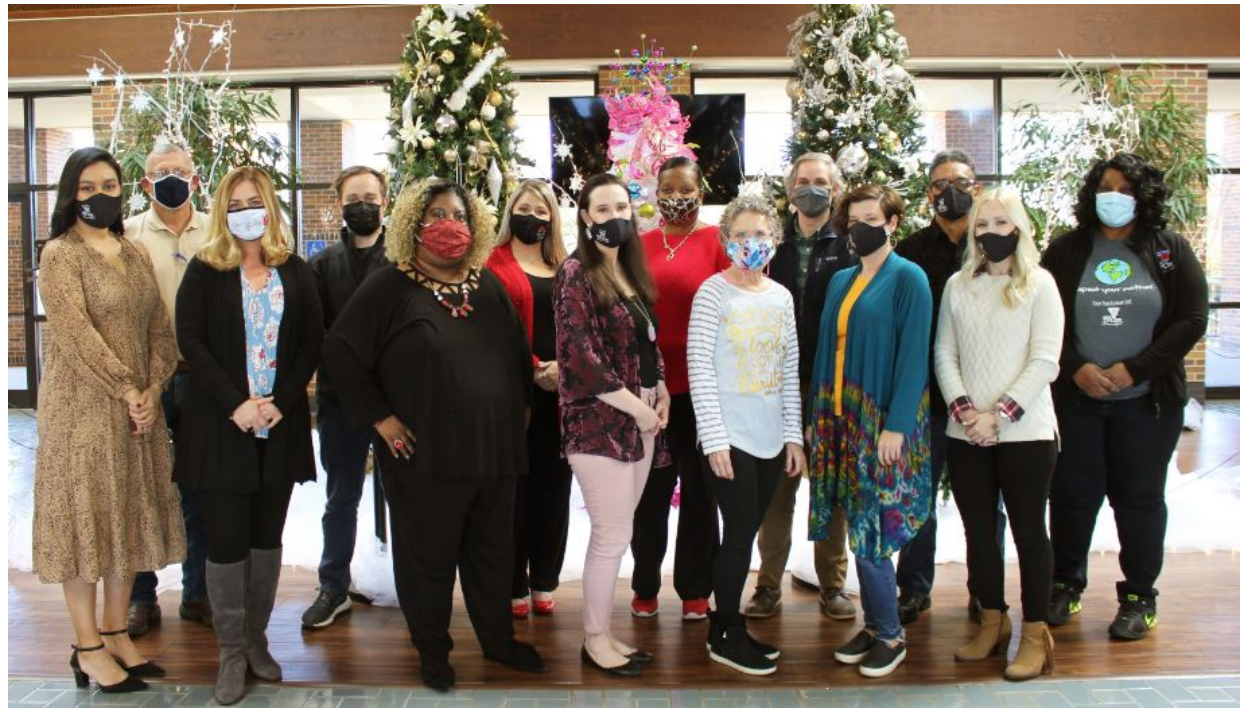
The Keep Tyler Beautiful Board members currently acts as Bee City USA committee.