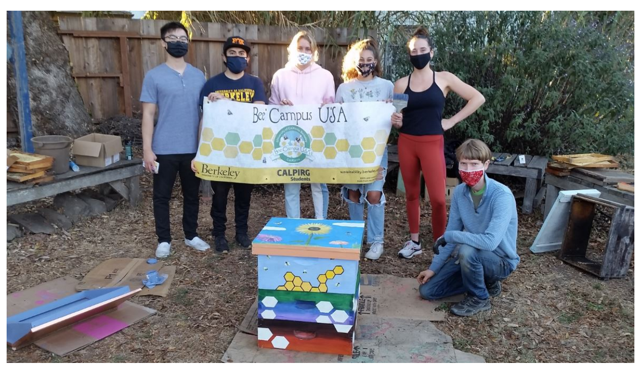
Some Group members after event