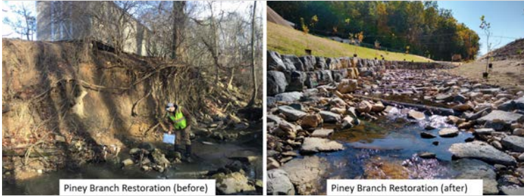
Piney Branch Restoration Before and After