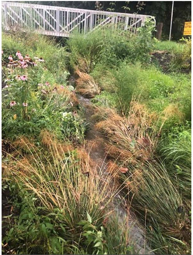
Community Center Pollinator Garden