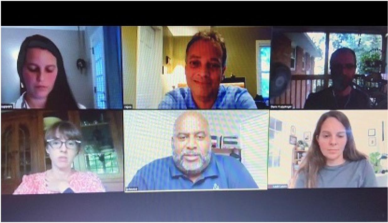
Community Sustainability Program Committee Virtual Meeting