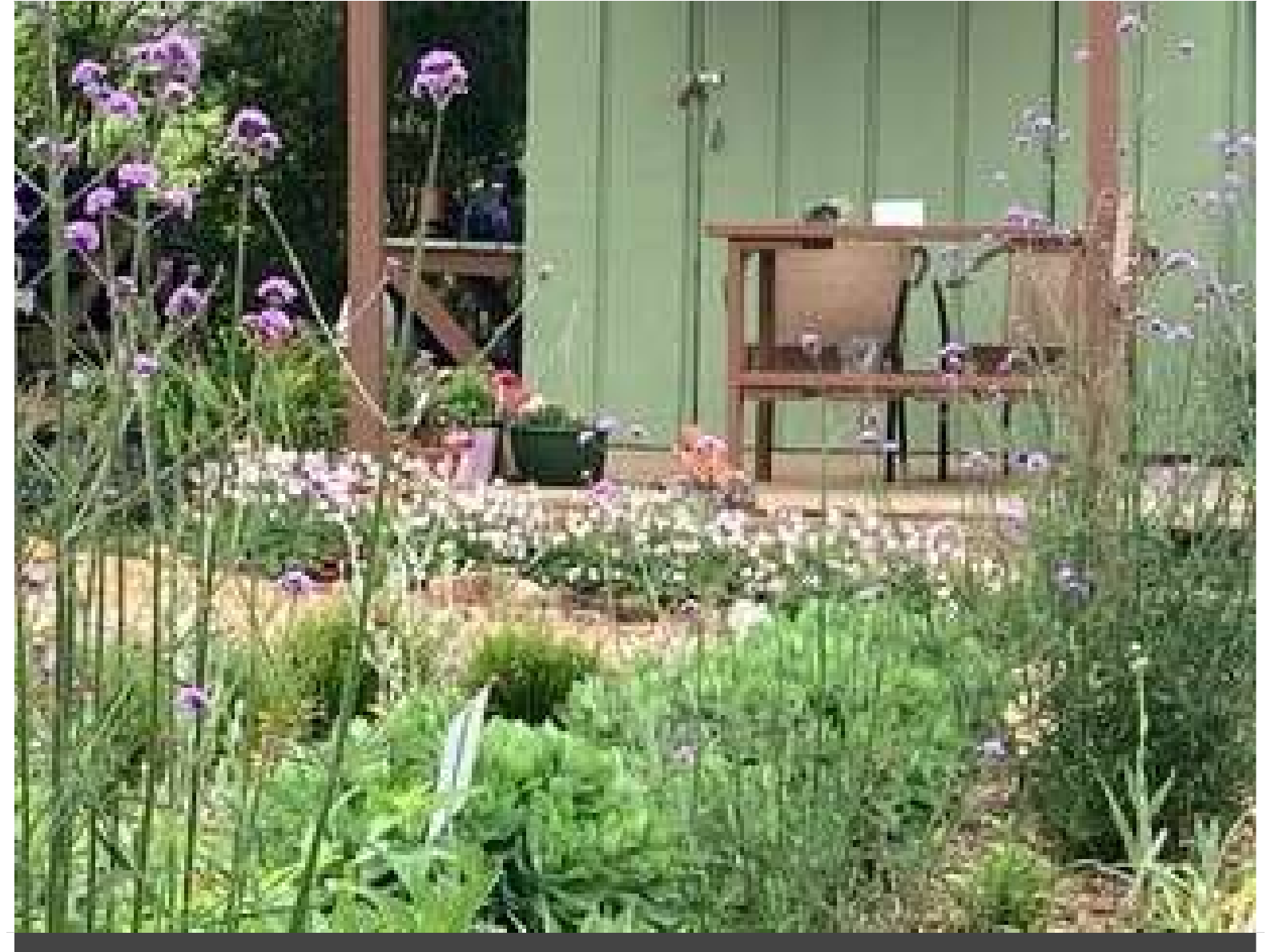
Inviting Plantings at Community Services building's Garden Center