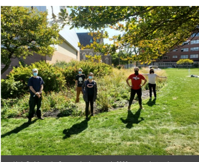
Little Prairie on the Campus planting event in 2020 gave students a chance to participant safely in an in-person event