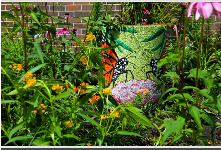
The Heritage Garden painted and reused old smoking urns to beautify the Monarch Butter? Habitat and to hold signs to educate passers-by of the importance of the garden.