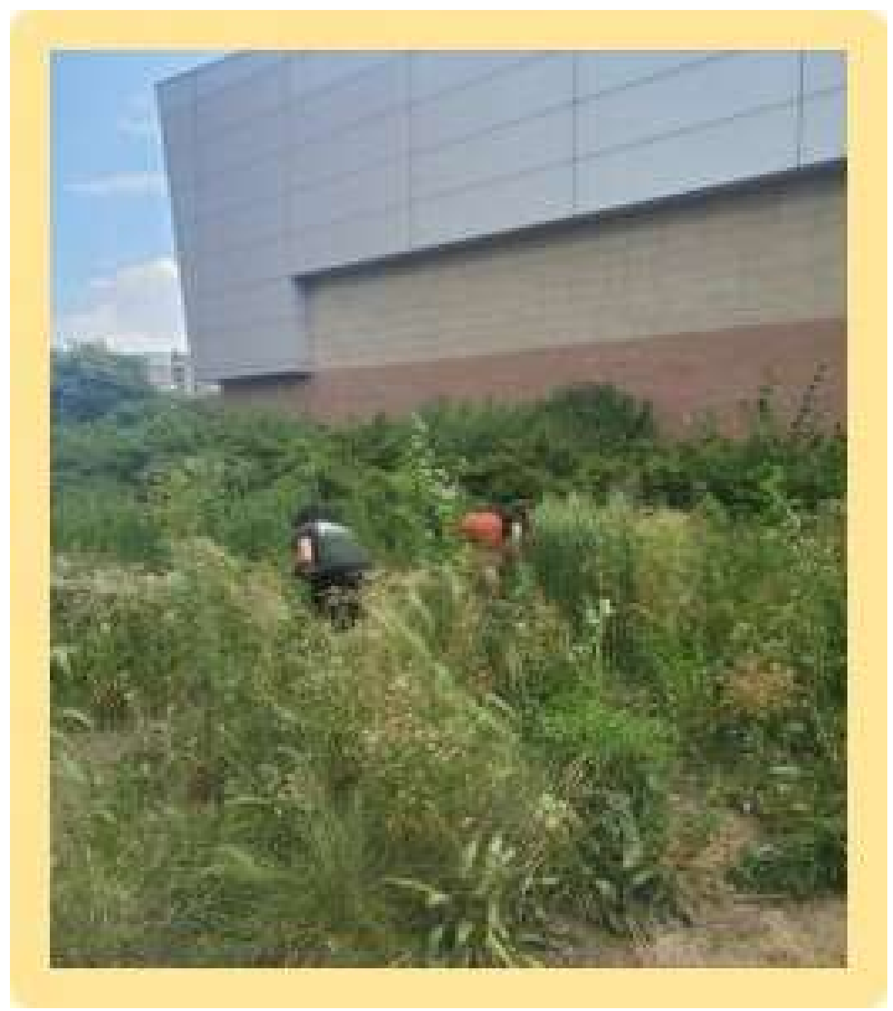
Volunteers manually pull weeds at the Little Prairie on the Campus native plant garden.