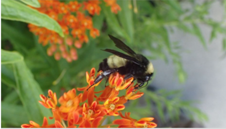
A June 2021 Facebook post from the Forestry Outreach Center

It's National Pollinator Week so let us highlight one of the frequent visitors to our pollinator garden. This is the American Bumblebee ( Bombus pensylvanicus ), Once one of the most common Bumblebees in North America unfortunately populations of this species have been heavily declining in recent years.