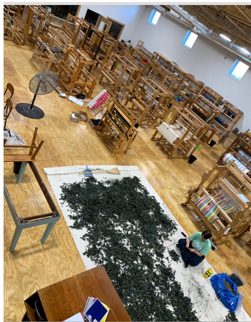
Pollinator-friendly Indigo from a new dye garden at the Horticulture Farm that was later harvested for textile hand dyeing for the Berea Student Craft Weaving Program