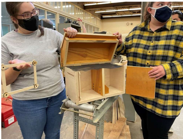
Students presenting a prototype of their beehive