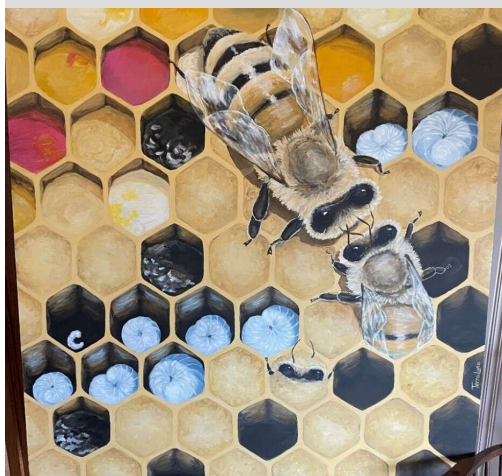
The first of several commissioned bee mural panels