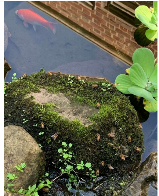
Pollinator-friendly Indigo from the new dye garden at the Horticulture Farm that was later harvested for textile hand dyeing for the Berea Student Craft Weaving Program