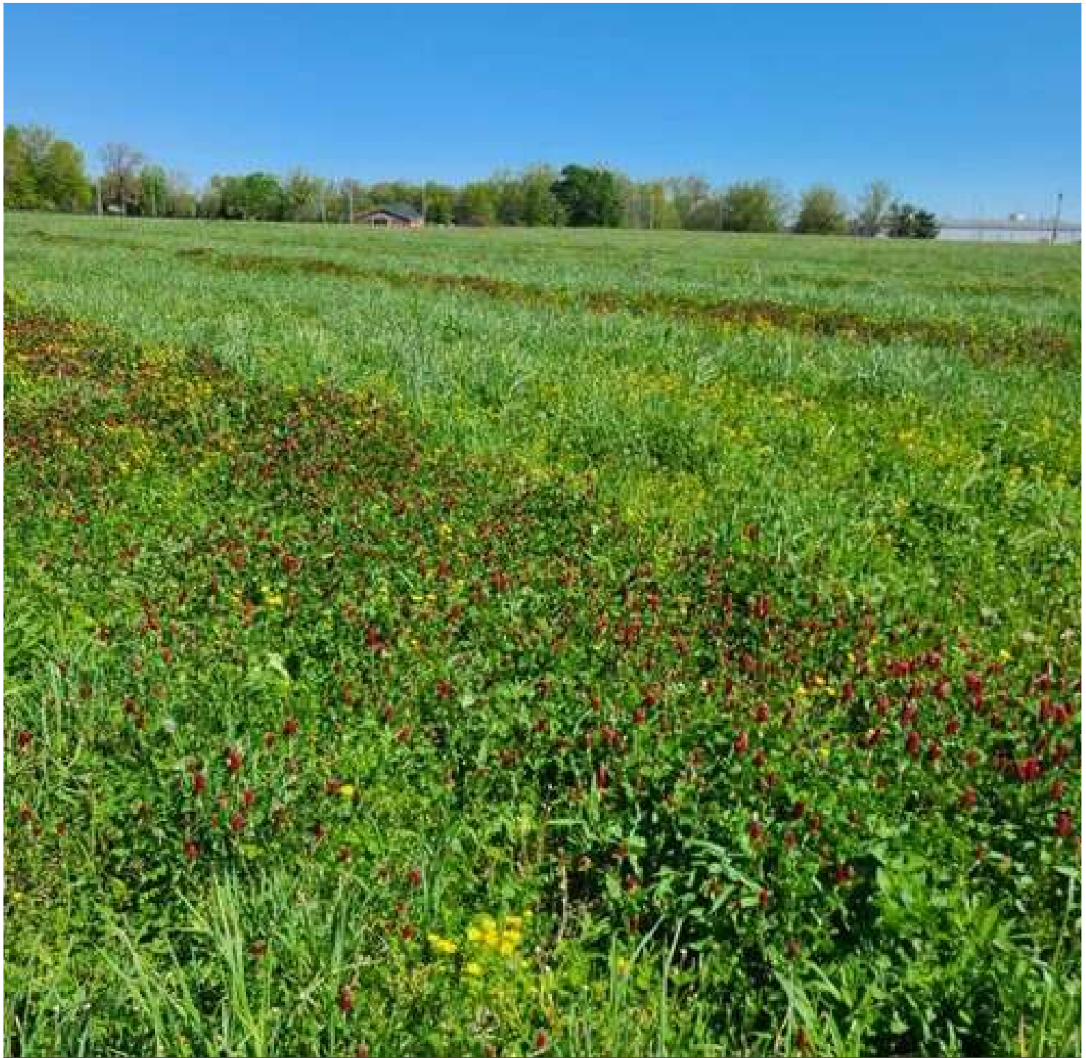
The Ecology course used this Crimson Clover patch as a laboratory in 2021