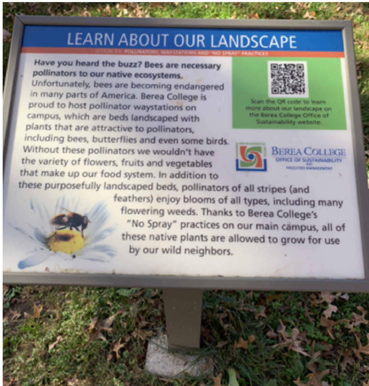
Permanent signage on the main campus that explains the College's "No Spray" practices

Recommended Native Plant Supplier List: Regional Suppliers of Native Pollinators Links.docx