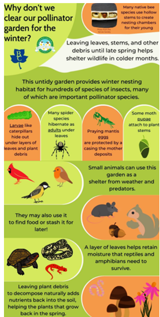
A temporary pollinator garden educational poster at the Forestry Outreach Center