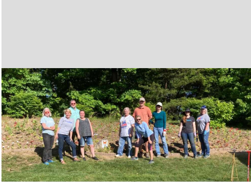
Bee Campus Committee enhances the monarch garden.

In 2021, we enhanced our Monarch Garden planting more milkweed and other flowers to attract monarchs. We also added about 400 square feet of pollinator habitat to our existing habitat as well as planting numerous native shrubs and trees throughout campus.