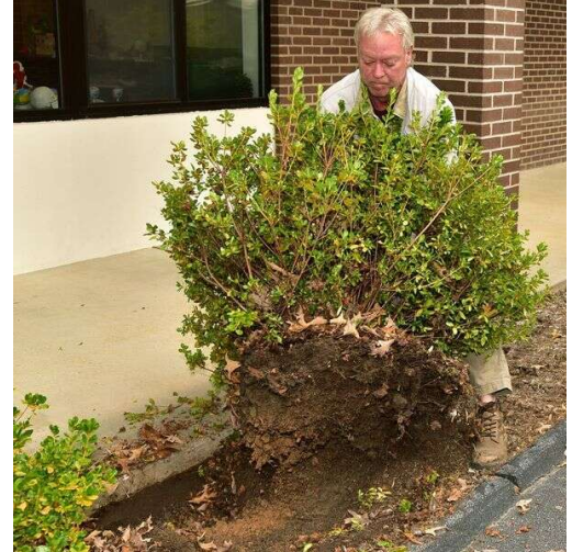
Planting native shrubs around campus