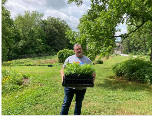
Gathering the milkweed at Milkweed Meadows Farm.