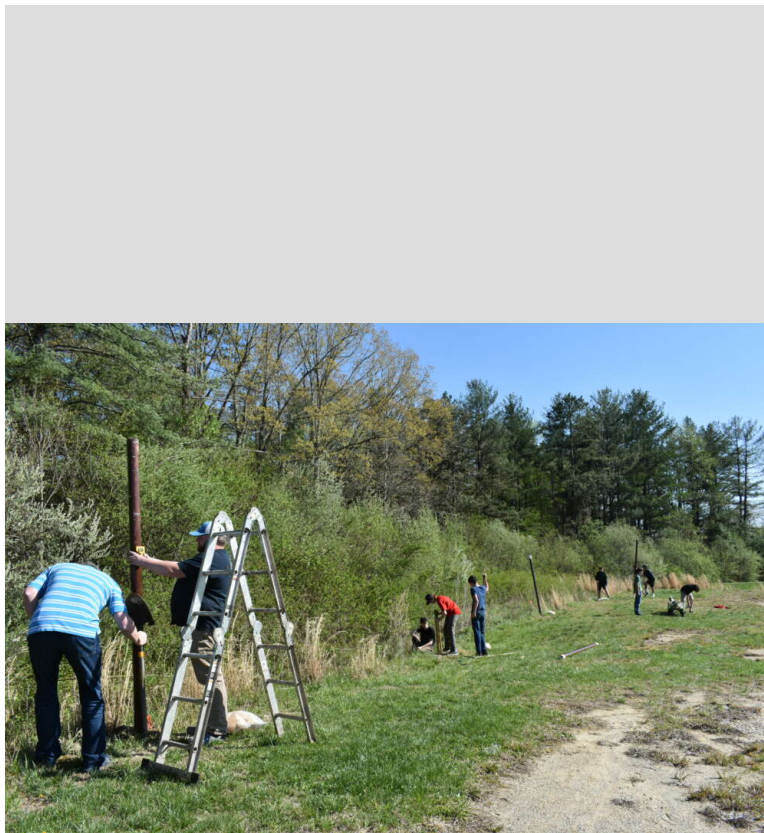
Eagle Scouts building and installing bat boxes on Blue Ridge's campus.