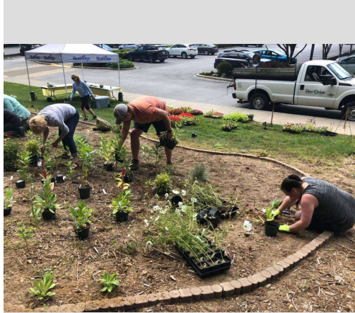
Bee Campus Committee enhances monarch garden