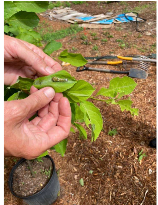
A milkweed caterpillar at Milkweed Meadows Farm.