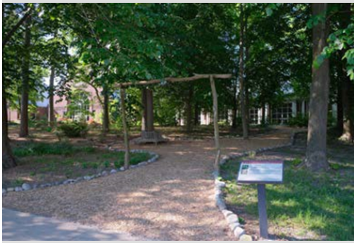
Native plant garden and trail

The Salisbury University Green Fund, a unique program designed to improve environmental sustainability at SU by giving students a say in how their sustainability fees are spent, funded a native species garden and walking path in the Spring of 2015. In the Spring of 2021, the Green Fund supported enhancements and revitalization of this garden path. The Green Fund also supported the purchase of native sedum plugs to enhance an existing living green roof on the Academic Commons. Additional 2021 projects included designating lawn areas where clover growth was encouraged and mown at less frequent intervals, Horticulture and Grounds continues to maintain the bee hive area and added more perennials nearby, cleaned storm water areas so native vegetation can thrive, and created new perennial gardens at the Honors House and Student Art Gallery locations with a majority of native plants.