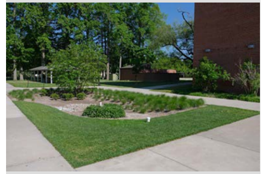
Native plants in bioswale