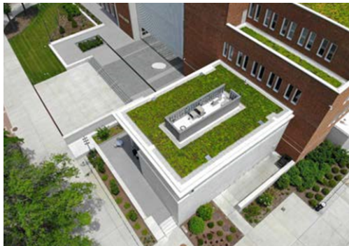
Native sedum planted on a green roof