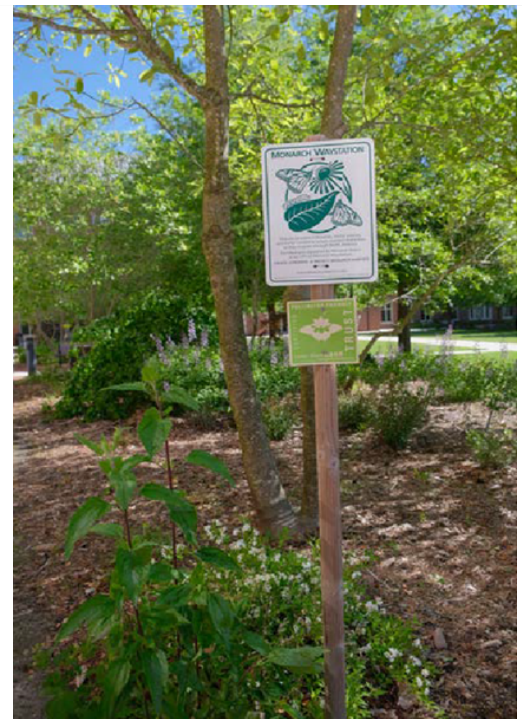
Monarch waystation and Lower Shore Land Trust pollinator friendly signs