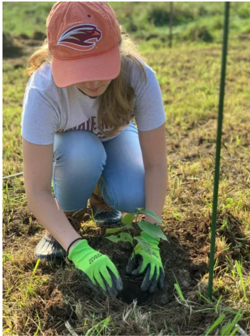
Planting Pawpaw trees at the Center for Environmental Education and Research