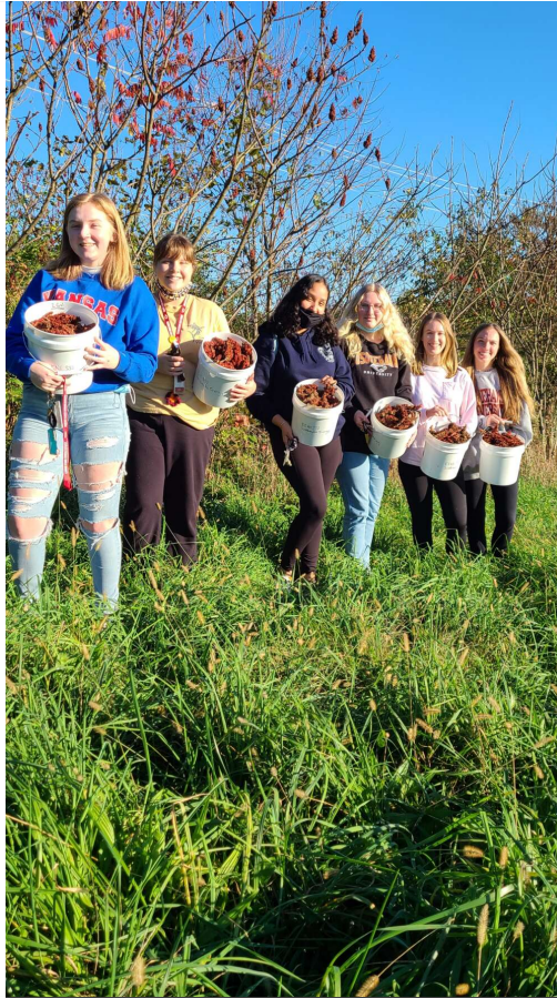
Sumac collection event to use for smoking fuel