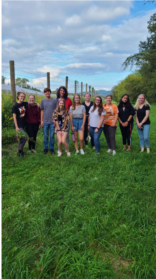
A photo of the students who went on the pollinator walk, featuring our solar panel array in the background!

Sustainability did a seed planting event for students and advertised on the plant tags that the plant (Black-eyed susan) was pollinator friendly!