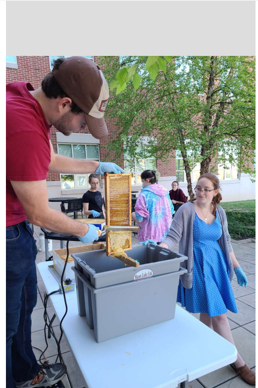
Extraction event held in a central campus location