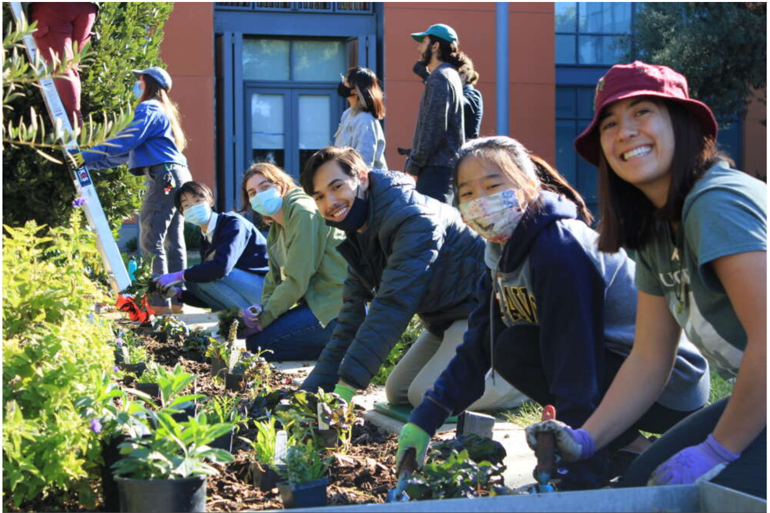
Students plant food crops and pollinator plants in the Good Life Garden in the courtyard of the Robert Mondavi Institute for Wine and Food Science.