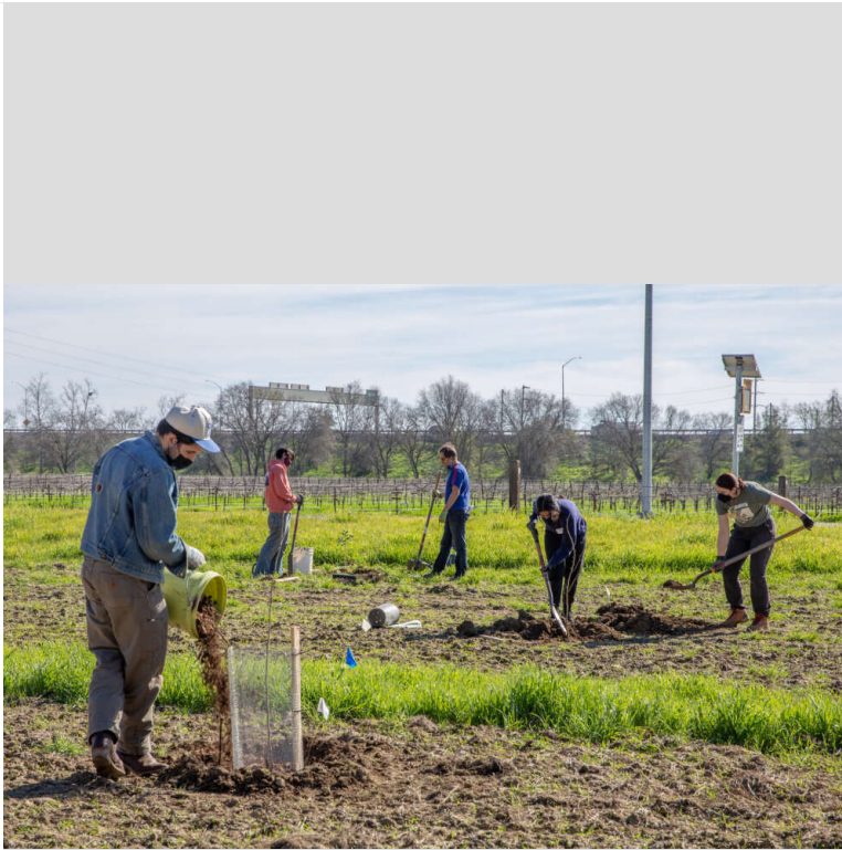
The Urban Tree Stewardship Team hosted a climate ready tree canopy planting day in the 3.5 acre zero long-term irrigation test plot for the Texas Tree Trial Research project. Several of the species are flowering trees or host trees for insects.