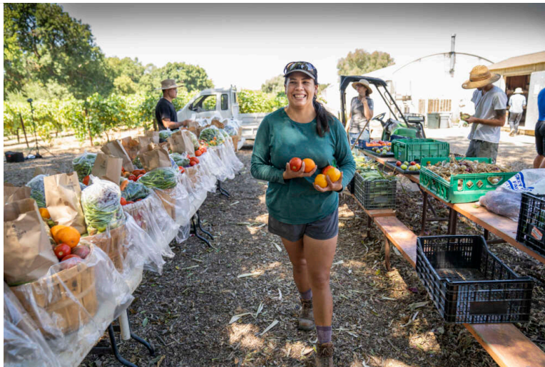
Interns learn about small-scale organic mixed vegetable production.