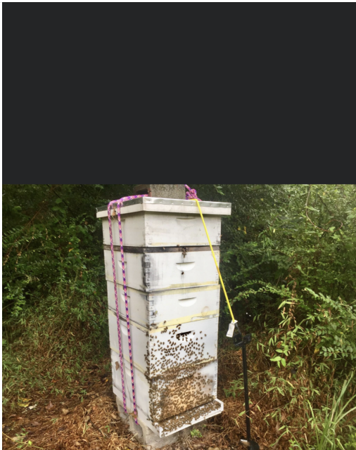
A photo of an active honeybee hive to show school students