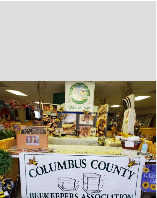
Columbus County hosts one of the largest agricultural fairs in the State. Each year, the Bee City USA Committee of the Columbus County Beekeepers Association provide pollinator education to thousands of visitors. See Bee City USA banner in back center.