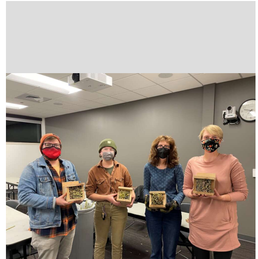
Students from the Fall 2021 Lifelong Learning class "Pollinators and their Habitat"; this course is offered 3x per year.