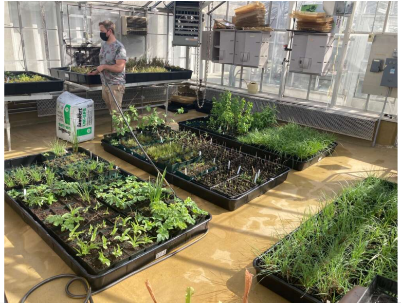
This community-engaged learning project, "Wetland in a Box", led by Blake Wellard and James Young (shown), has University of Utah students help propagate and plant out over 100 species of native Utah wetland species to provide better habitat for Utah's pollinators and other wildlife species