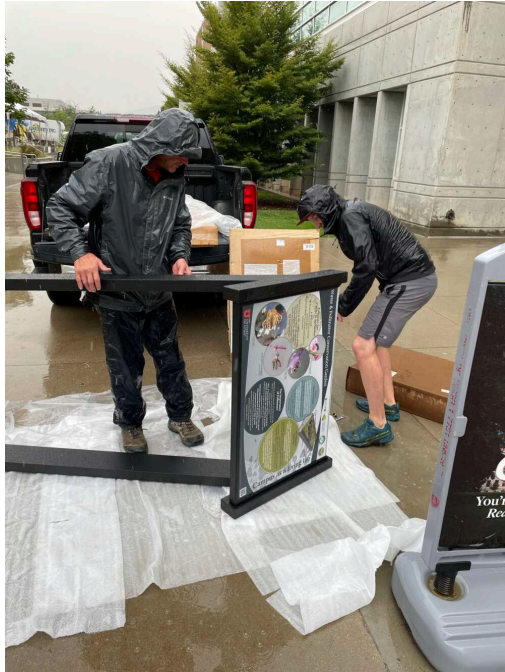
Prepping our brand-new Pollinator Conservation Interpretive sign at the University of Utah

October, showing their life stages and tagged and release the adult butterflies. o In addition we had set ups for native caterpillars, including: Viceroy, Two-tailed swallowtail, Weidemeyer's Admiral, Gray hairstreak, and Mourning Cloak. o Installation of 6 bee boxes 2 We had multiple summer camps that included education on and about various pollinators. We reached about 50 campers. 2 We also had a Garden Adventure Kit all about insects and pollinators that was purchased by 24 children.2 SLC Bee fest (did it happen in 2021?) 2 Polleneighbors was open for self-guided tours from April through October. Some signage is still up for the winter. Admission to Red Butte Garden and Polleneighbors exhibit: Admission month Child Adult TOTAL May-21 3481 18565 22046 Jun-21 3036 13797 16833 Jul-21 2981 11696 14677 Aug-21 2082 9617 11699 Sep-21 2184 11806 13990 Oct-21 * * 20665 Total: 99910