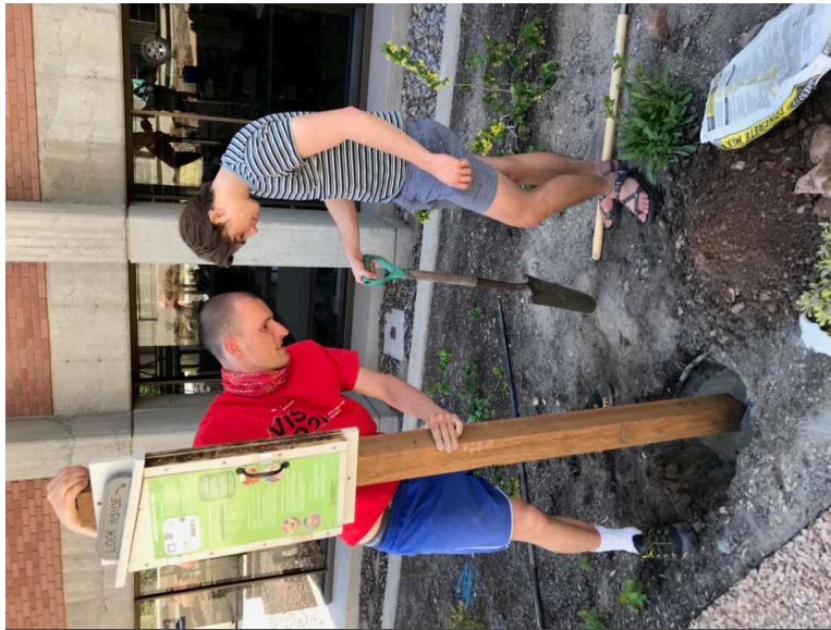
Installation of an observation native bee nestbox on campus by University of Utah students, with plenty of bare soil for ground-nesters too

3 observation nestboxes installed on campus 75 nestboxes via sponsorship of HTHF event Ask facilities partners (John Walker) 4th nestbox installed on upper campus? Continued maintenance and repair of Pollinator Conservation Garden? Installation of 6 bee boxes Braided grasses for winter habitat Left leaf piles about and a lot of grasses uncut for winter habitation