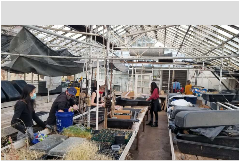
Students from Conservation Biology, Spring 2021, propagating pollinator-friendly native plants for wetland restoration